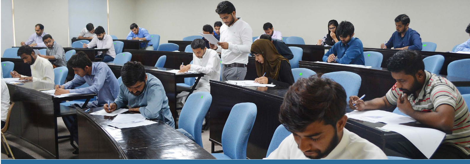
Recruitment Test for Positions in District & Sessions Court, Karachi

Sukkur IBA University conducted the recruitment test for the various openings that were announced in August 2018. The test was conducted at Sukkur IBA University.